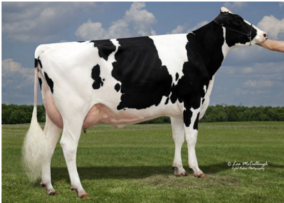
SYNERGY UNO POT O GOLD FOURTH DAM