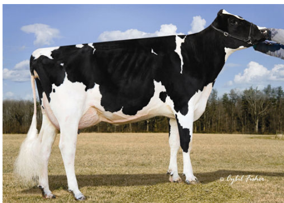
FLY-HIGHER BOLTON MISHA FIFTH DAM