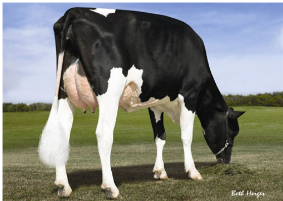
FLY-HIGHER OBSERV MICA FOURTH DAM