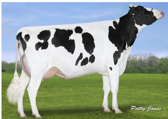
MS FARNEAR MICA MARGARITA THIRD DAM