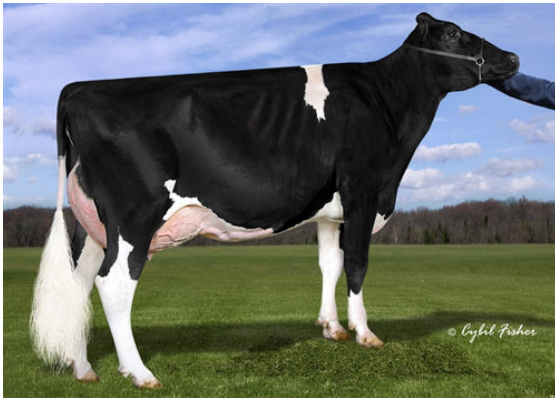
VIEW-HOME MRDIAN IOWA FOURTH DAM