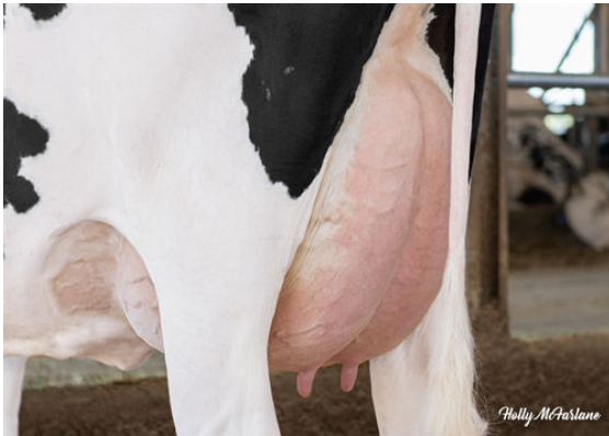
SILVERRIDGE V MARIUS EVICTION DAM