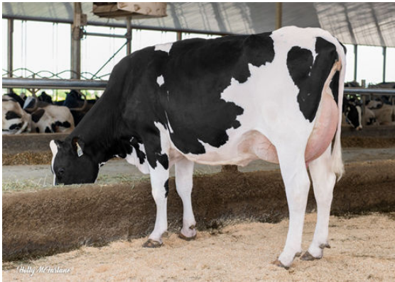
SILVERRIDGE V MARIUS EVICTION DAM