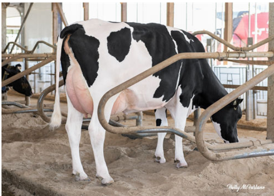
SILVERRIDGE V MARIUS EVICTION DAM