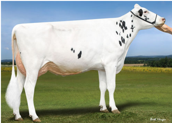
LADYS-MANOR GRNT OOHM GRANDDAM