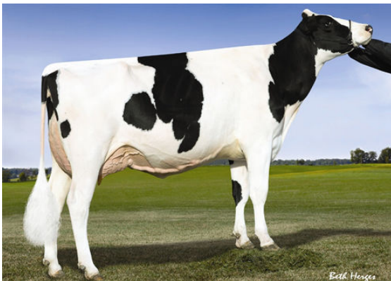
LADYS-MANOR DORCY ODA FOURTH DAM