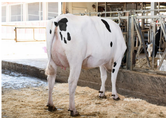
FB LULU ACHV VEGAS GRANDDAM