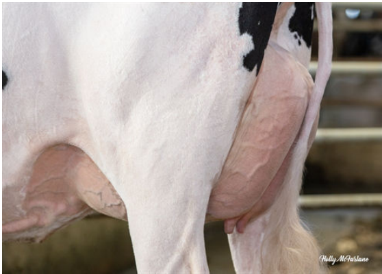
WESTCOAST HLYSMK ZAZZLE 14058 DAUGHTER