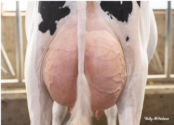
WESTCOAST HLYSMK ZAZZLE 14058 DAUGHTER