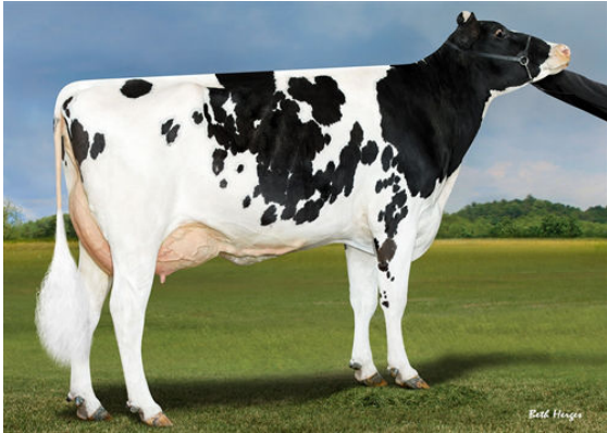
BOMAZ MEDLEY 8072 DAM