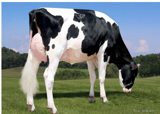
OUR-FAVORITE COMPELLING GRANDDAM