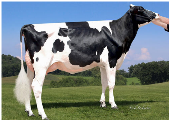
OUR-FAVORITE COMPELLING GRANDDAM