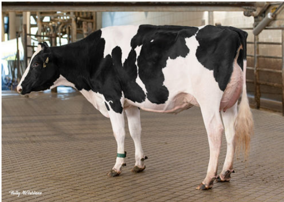
WESTCOAST RYLFLSH NAPPY 13063 DAUGHTER