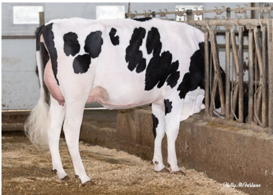
PROGENESIS ROYALFLUSH PAPAYA DAUGHTER