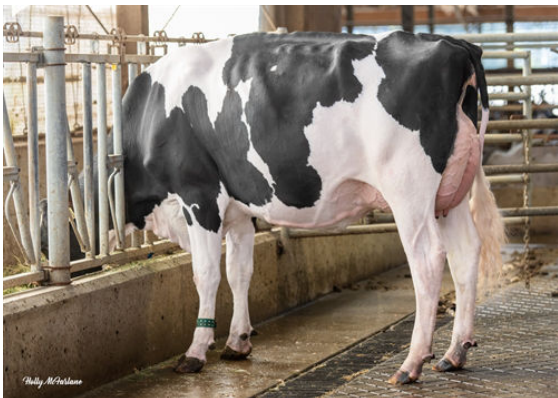
WESTCOAST RYLFLSH NAPPY 13063 DAUGHTER