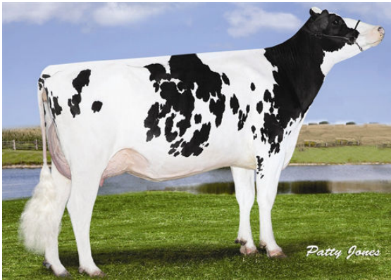
RUSSELLWAY CAMERON PINKY FIFTH DAM