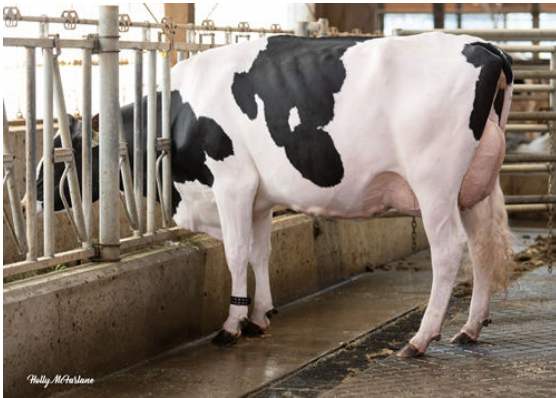
WESTCOAST MAHOMES SKY 12669 DAUGHTER