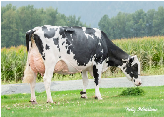
WESTCOAST ALCOVE RIZA 7512 DAM