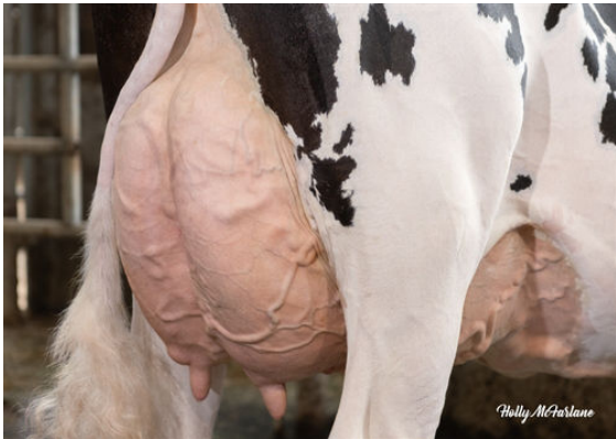
WESTCOAST ALCOVE RIZA 7512 DAM