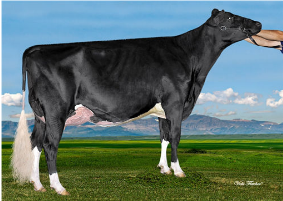
WESTCOAST MONTANA RIZA 4700 GRANDDAM