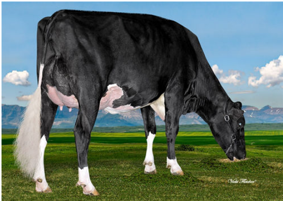
WESTCOAST MONTANA RIZA 4700 GRANDDAM