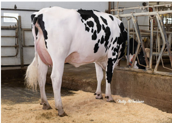
PROGENESIS MARIUS MARKS DAM