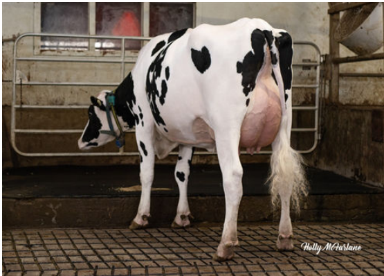
PROGENESIS MARIUS MARKS DAM