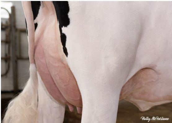
PROGENESIS MARIUS MARKS DAM