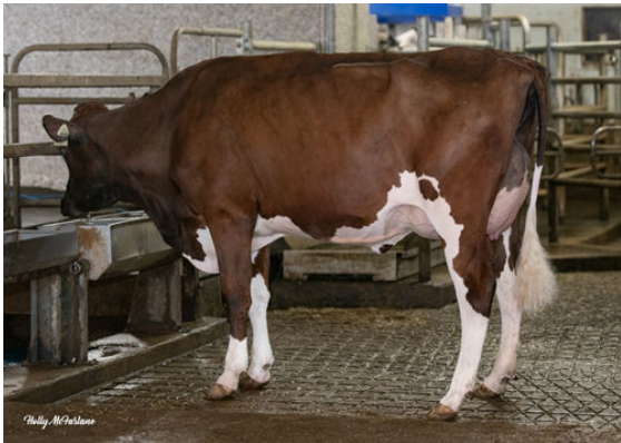
PROGENESIS CHAMPION TIANNA DAUGHTER