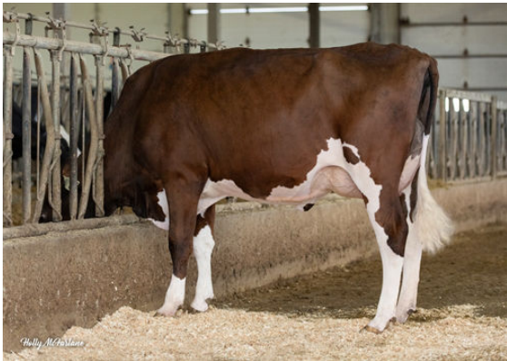
PROGENESIS CHAMPION TIANNA DAUGHTER