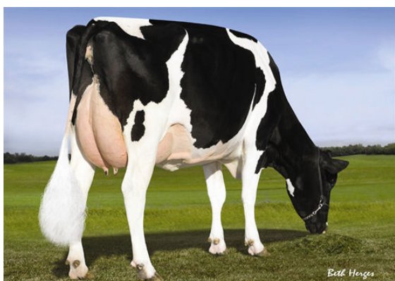
PINE-TREE 2149ROBST 4846 FOURTH DAM