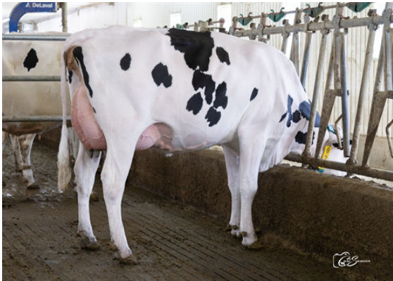
ANTIA ALLDAY BRITE DAUGHTER