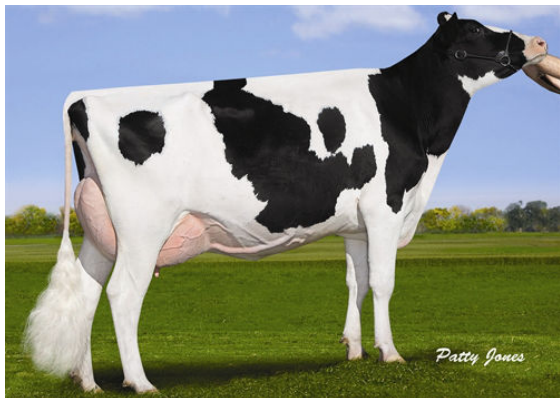
OCONNORS PLANET LUCIA THIRD DAM