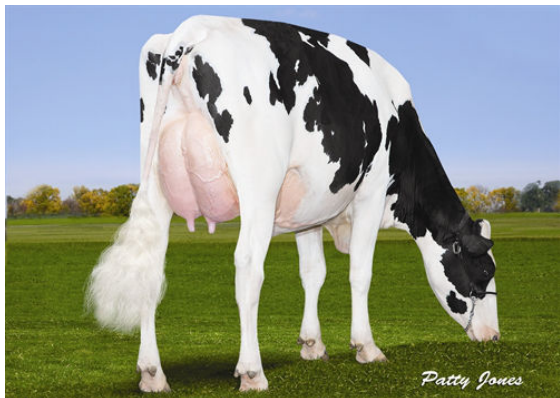
OCONNORS LAST HOPE GRANDDAM