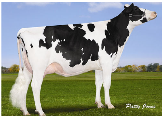
OCONNORS LAST HOPE GRANDDAM