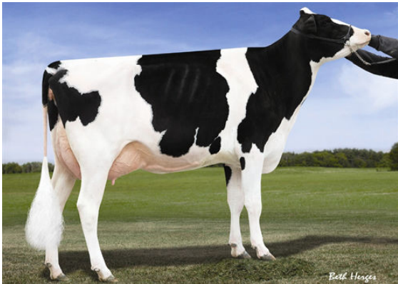
MORSAN MAN D MISSY FIFTH DAM