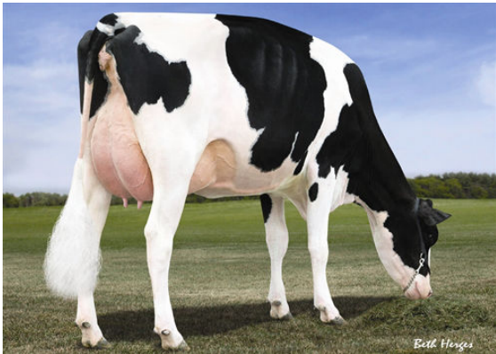
MORSAN MAN D MISSY FIFTH DAM