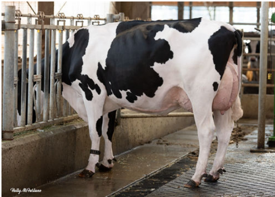
WESTCOAST MNTBLNC FR8167 11529 DAUGHTER