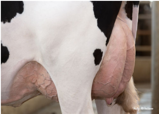
WESTCOAST MNTBLNC FR8167 11529 DAUGHTER