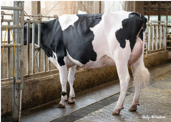
PROGENESIS MONTB ENERGIZER P DAUGHTER