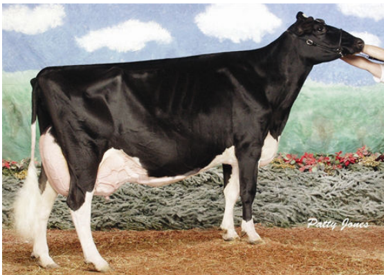
IDEE LUSTRE FIFTH DAM