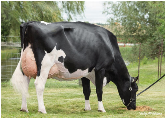
QUALITY SOLOMON LUSTFUL DAM