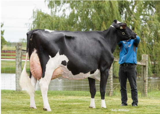
QUALITY SOLOMON LUSTFUL DAM