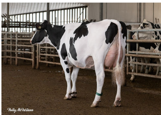
STANTONS COCKPIT PEPPERMINT DAUGHTER