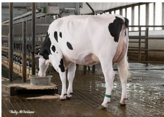
STANTONS COCKPIT BRANDY DAUGHTER