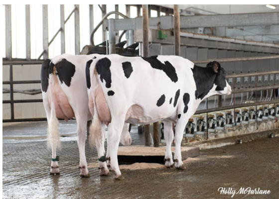
COCKPIT DAUGHTER GROUP L TO R - STANTONS COCKPIT BRANDY, STANTONS COCKPIT PEPPERMINT