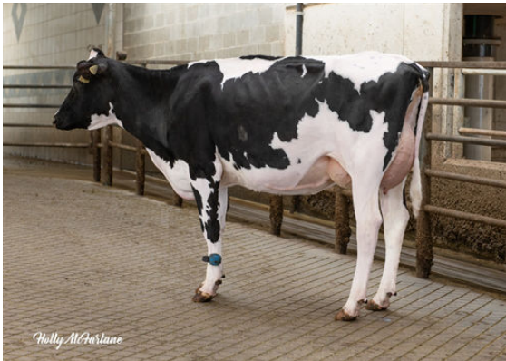
WESTCOAST MLIRE FAR8391 11926 DAUGHTER