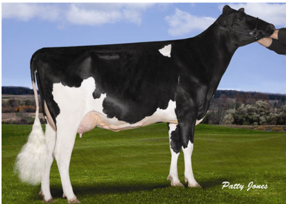
STANTONS FREDDIE CAMEO FOURTH DAM