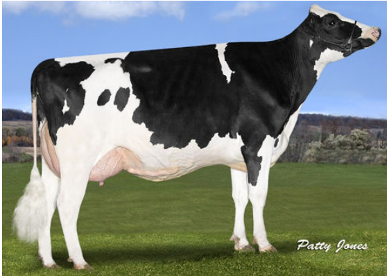
STANTONS CAMEO APPEARANCE GRANDDAM