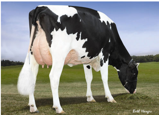
LARCREST CALE FOURTH DAM