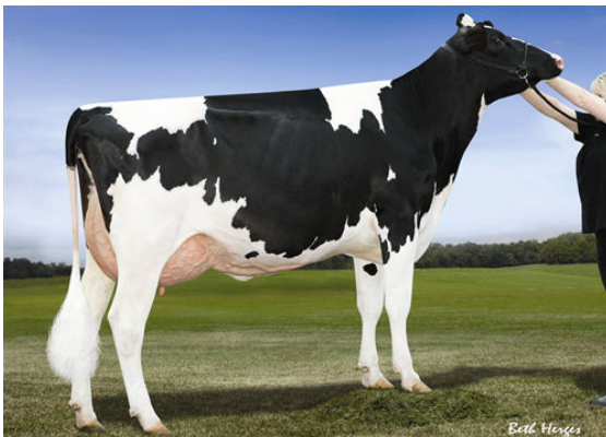
LARCREST CALE FOURTH DAM