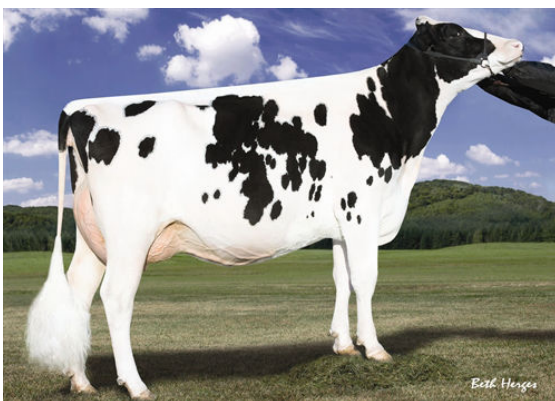
LARCREST CRIMSON FIFTH DAM