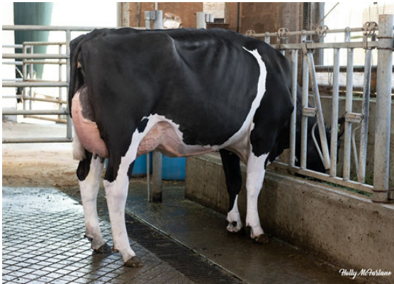
WESTCOAST FSTBL FAR8167 10707 DAUGHTER