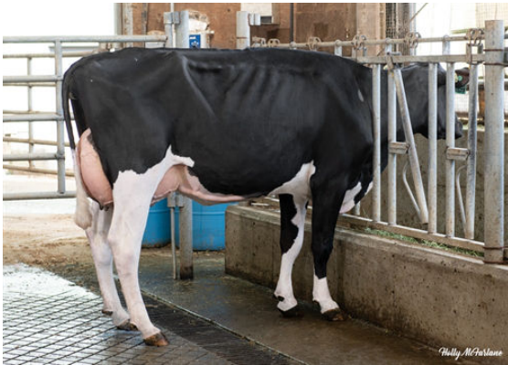
PROGENESIS FASTBALL PRISSY DAUGHTER