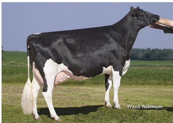
RI-VAL-RE GOLDWYN NADINE FIFTH DAM