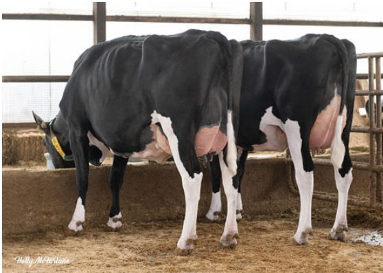
RIVER DAUGHTER GROUP L to R - ARMSTRONG MANOR IVY 4650, ARMSTRONG MANOR IDONIE 4683