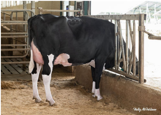
ARMSTRONG MANOR IDONIE 4683 DAUGHTER