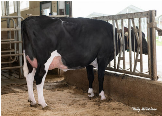
ARMSTRONG MANOR IVY 4650 DAUGHTER