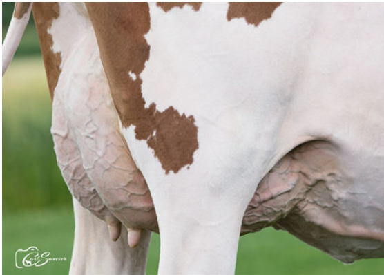
MICHERET SAUGE ZOOM RED DAUGHTER