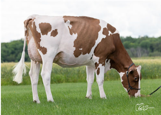
MICHERET SAUGE ZOOM RED DAUGHTER