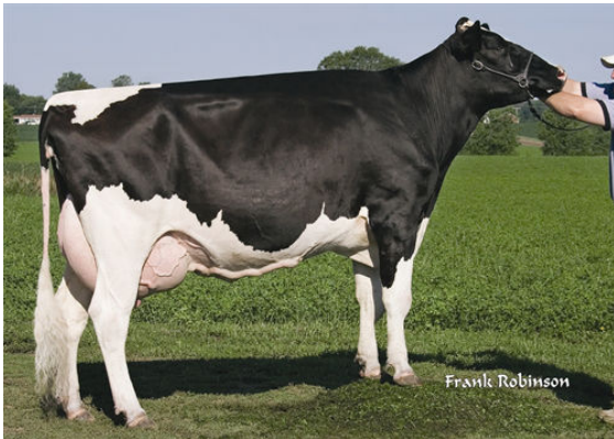
RI-VAL-RE OMAN NIKE FIFTH DAM