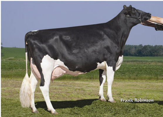
RI-VAL-RE GOLDWYN NADINE FOURTH DAM