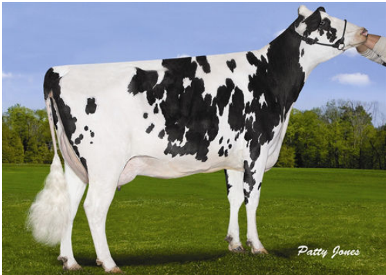
STANTONS SUPER ELDA FOURTH DAM