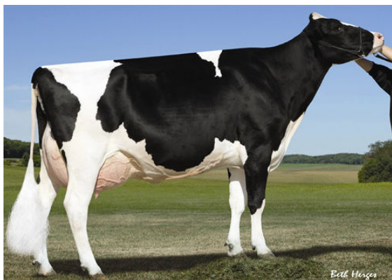
HENDEL BOLTON MUSIC 2602 FIFTH DAM