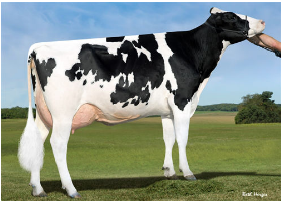
SANDY-VALLEY MORGAN ERA GRANDDAM