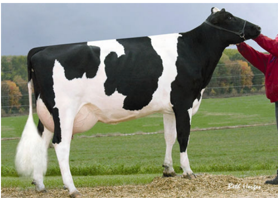
SANDY-VALLEY BOLT SHEILA FIFTH DAM