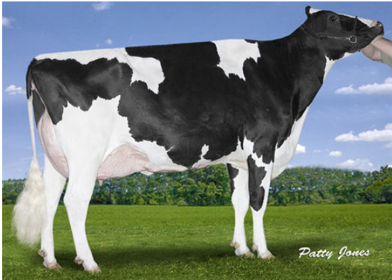
CLAYNOOK DEWDROP MONTEREY DAM