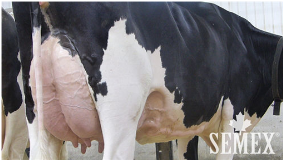
CLAYNOOK DIVINITY UNIX GRANDDAM