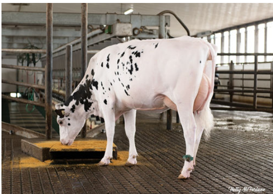
STANTONS PURSUIT OF JUSTICE DAUGHTER