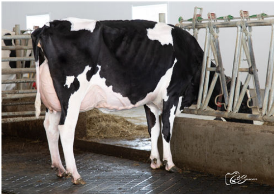
PROGENESIS PURSUIT DIETIES DAUGHTER