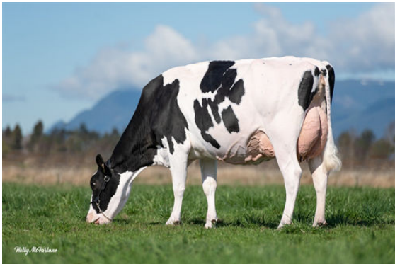
WESTCOAST PSUIT LAUMAB 8996 DAUGHTER