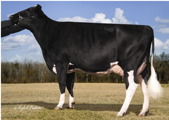
WELCOME BILLION WIOMMI FOURTH DAM