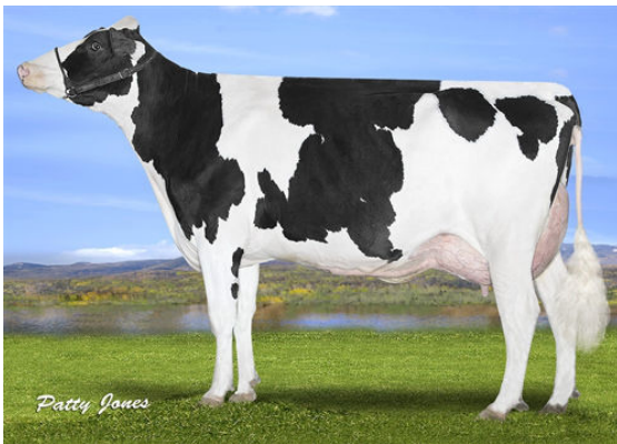
RI-VAL-RE DELTA GEORGIA