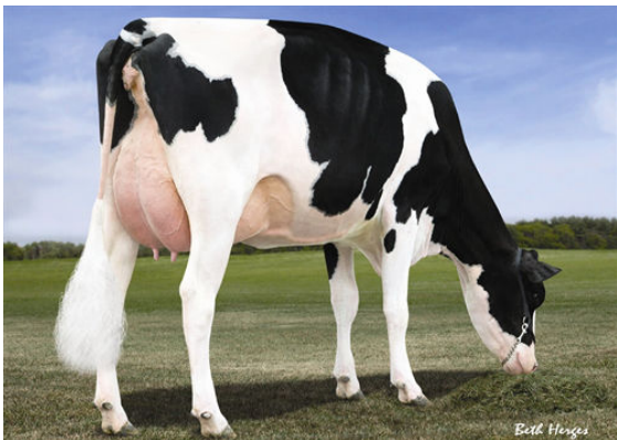
MORSAN MAN D MISSY THIRD DAM