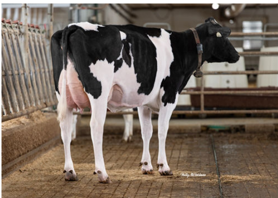
PROGENESIS CHALLENGER EMBRACE