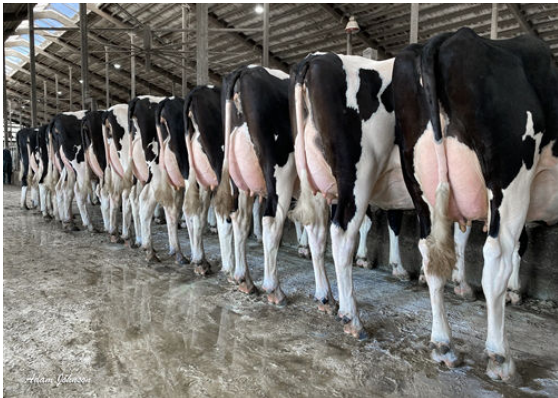
CHALLENGER DAUGHTER GROUP DAUGHTERS AT SANDY-VALLEY