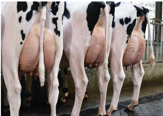
ALCOVE DAUGHTER GROUP L-R WESTCOAST ALCOVE KOO 7550, WESTCOAST ALCOVE LOYAL 8347, WESTCOAST ALCOVE SILV3063 8221