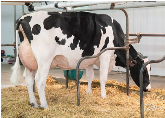
DESROSS ALCOVE STORTI DAUGHTER