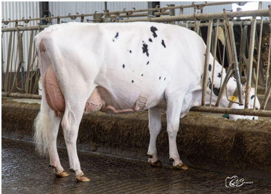
DUPORTAGE ALCOVE FROZEN DAUGHTER