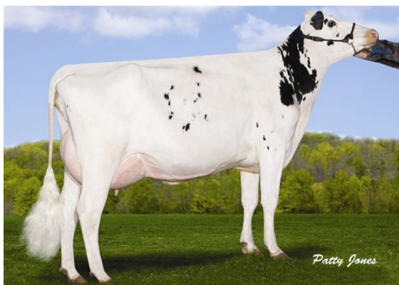
CALBRETT PLANET EVE FOURTH DAM