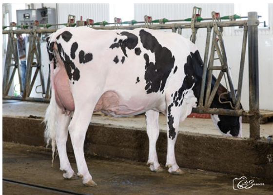
MICHERET VIARAIL SUMMERDAY DAUGHTER