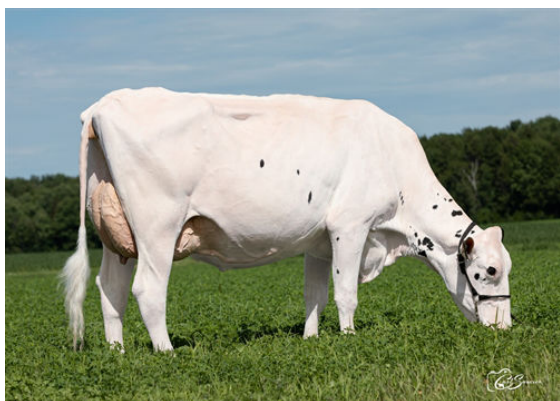
MICHERET VIAGRA SUMMERDAY DAUGHTER