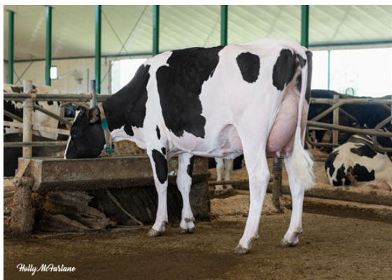
ROOSBURG SUMMERDAY COOL SHADE DAUGHTER