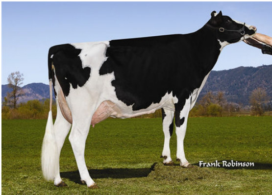
RONELEE FACEBOOK DARCY GRANDDAM