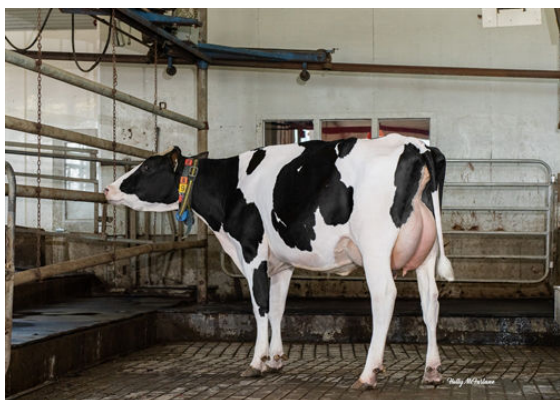
PROGENESIS MAVERICK MOVER