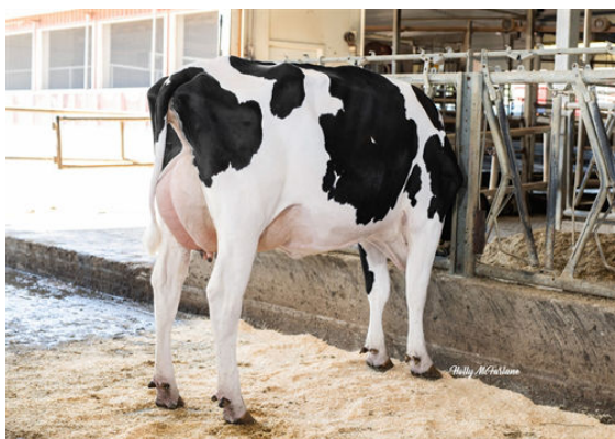
PROGENESIS MAVERICK MOVER