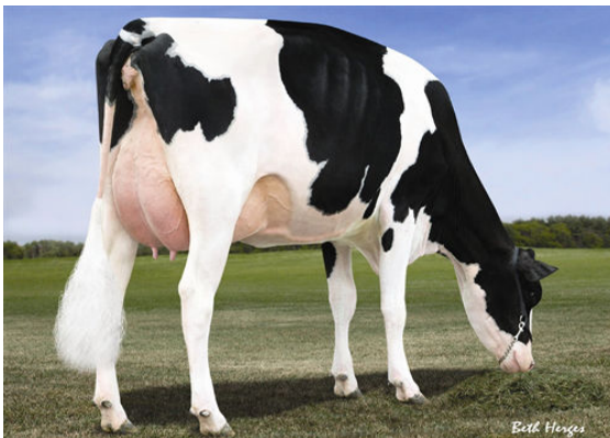
MORSAN MAN D MISSY THIRD DAM