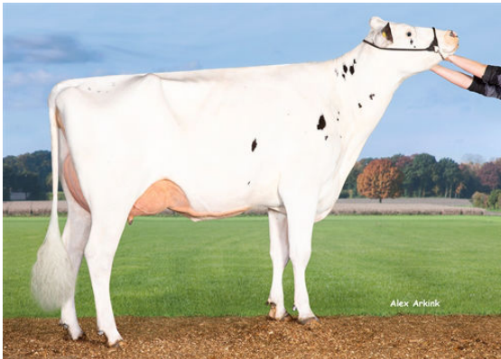
K&L OH ROZELLA DAUGHTER