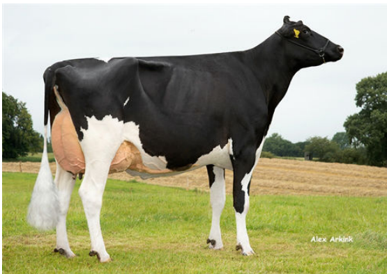
HAH 28552 DAUGHTER