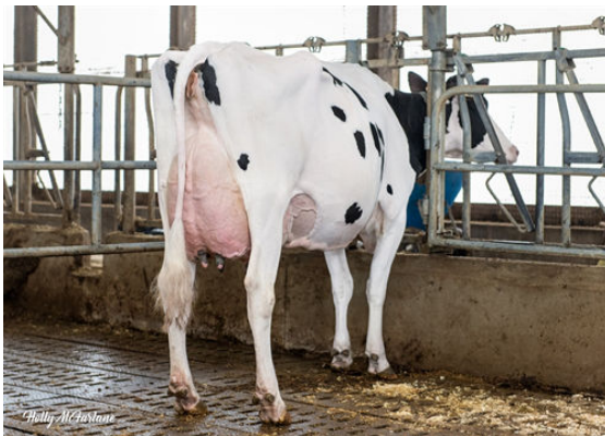
WRICO GYMNAST TILDA DAUGHTER