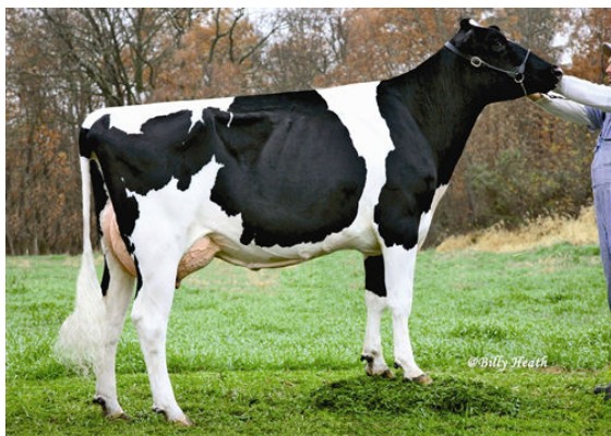
HARVUE SHOTTLE ESTHER THIRD DAM