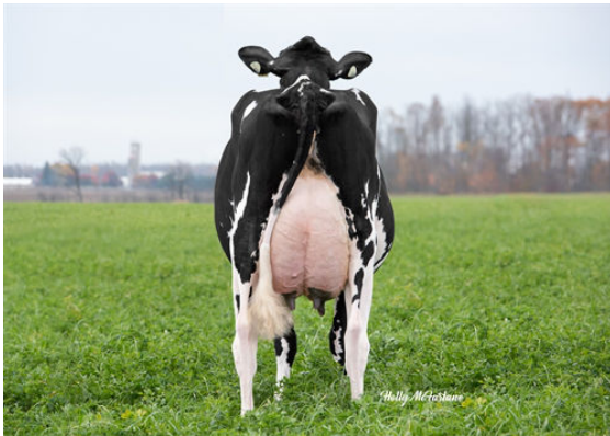
CARLDOT WINDMILL LAYLA