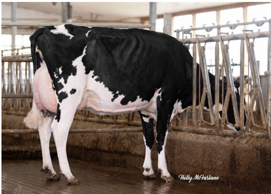
CARLDOT WINDMILL LAYLA