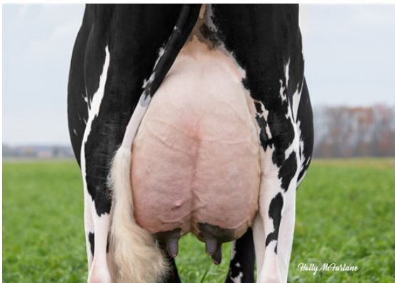
CARLDOT WINDMILL LAYLA