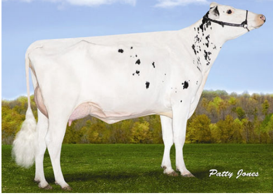
VELTHUIS SG SNOW EVENT GRANDDAM